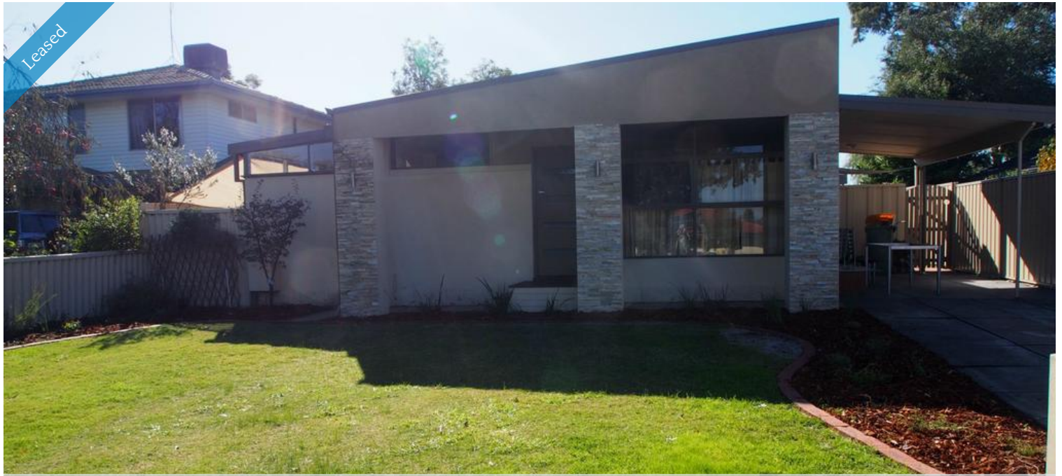
204 Anzac Terrace, Bassendean