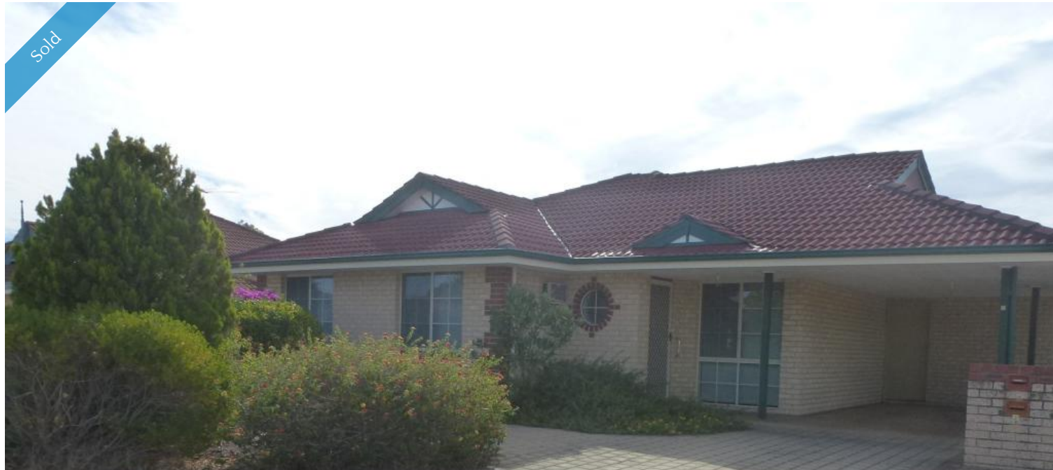
Unit 1, 8 Ryce Ct, Eden Hill