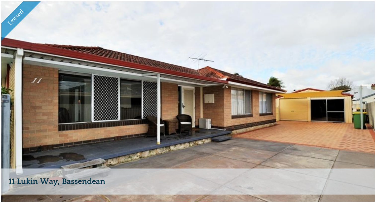
11 Lukin Way, Bassendean