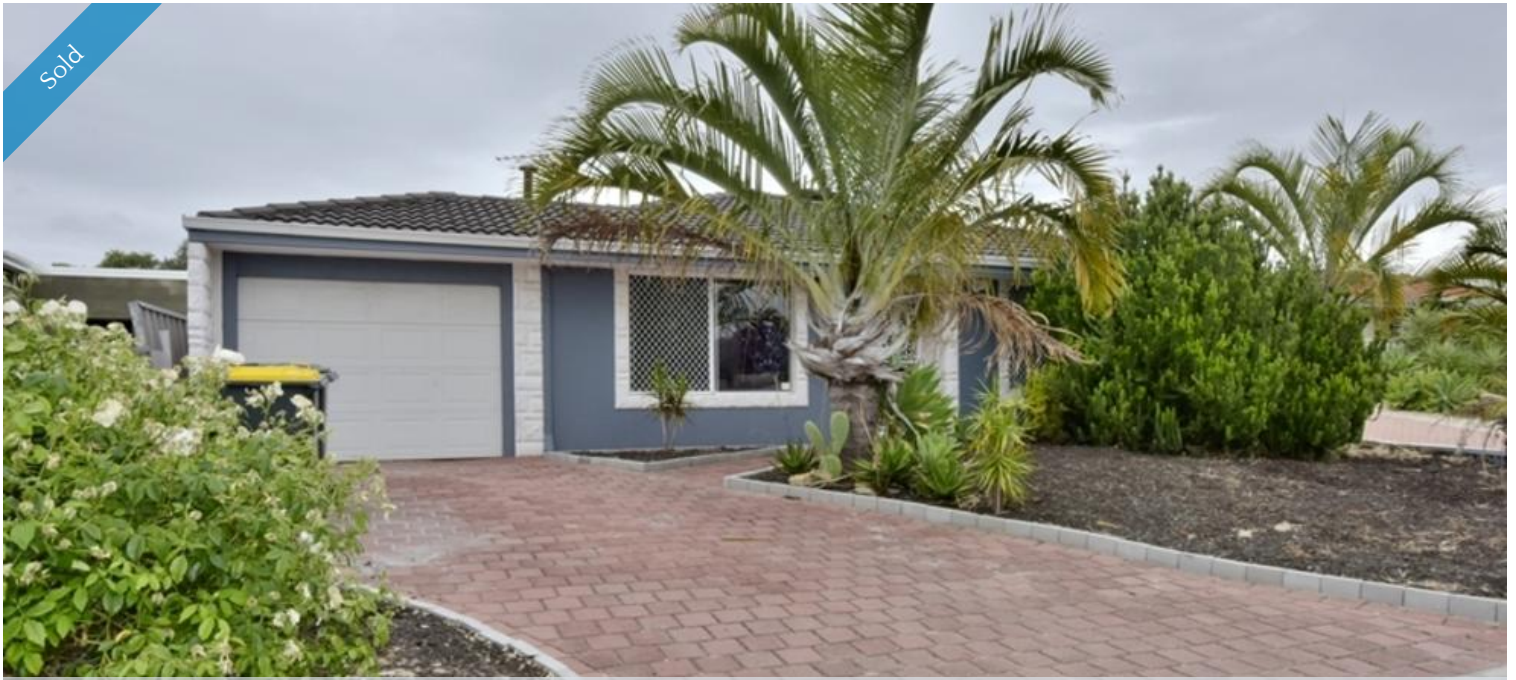
3 Olin Rise, Lockridge