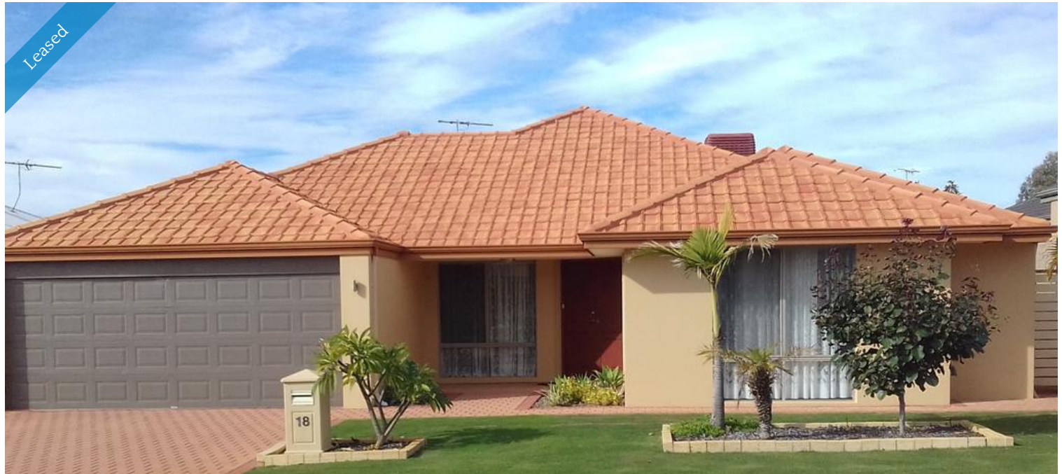
18 Castlebar Way, Darch